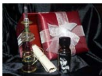
Exclusive JALN Perfume