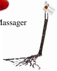
Cat O Nine Tails