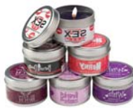
1 Pheromone Candle