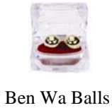
Ben Wa Balls

Kit B $515.00 ($30 s/h) *subject to change without notice *can be altered once you're a JALN Consultant