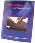
Erotic Massage Book